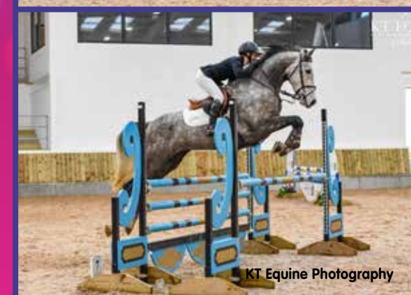
KT Equine Photography