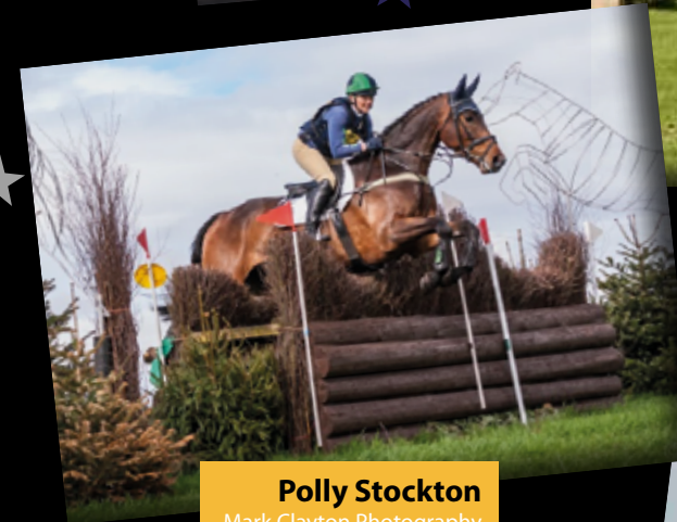
Polly Stockton Mark Clayton Photography