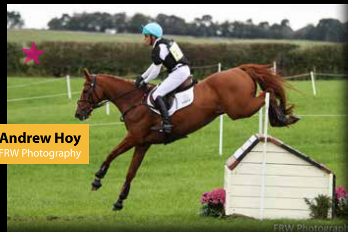
Andrew Hoy FRW Photography