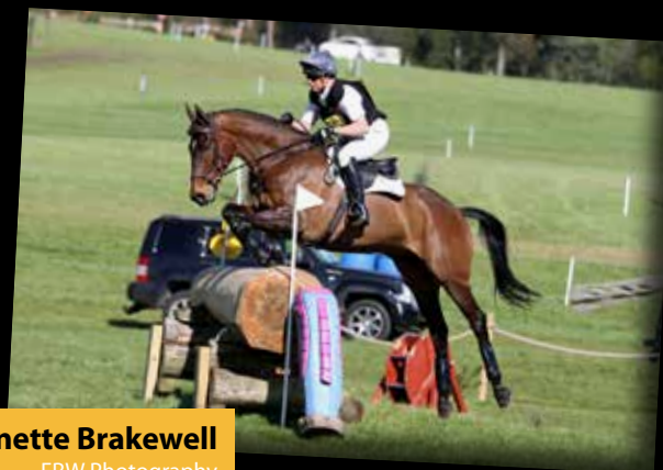
Jeanette Brakewell FRW Photography