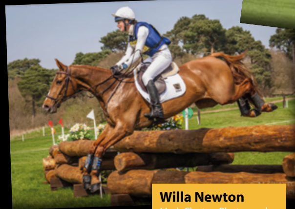
Willa Newton