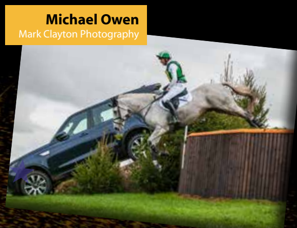
Michael Owen