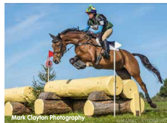
Mark Clayton Photography