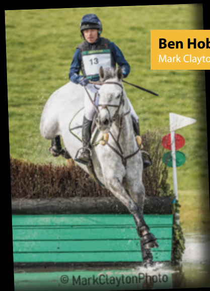
Ben Hobday