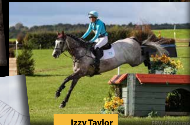
Izzy Taylor FRW Photography