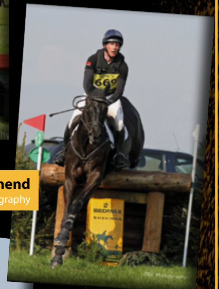
Oliver Townend