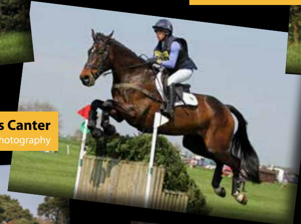
Ros Canter FRW Photography