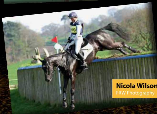
Nicola Wilson FRW Photography